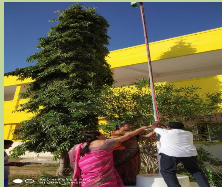
Republic day was celebrated, Flag hoisting was done and sweets were distributed