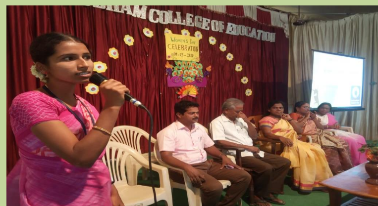
Programme on “Women Achievers” and special songs were performed by Staff and Student teachers.