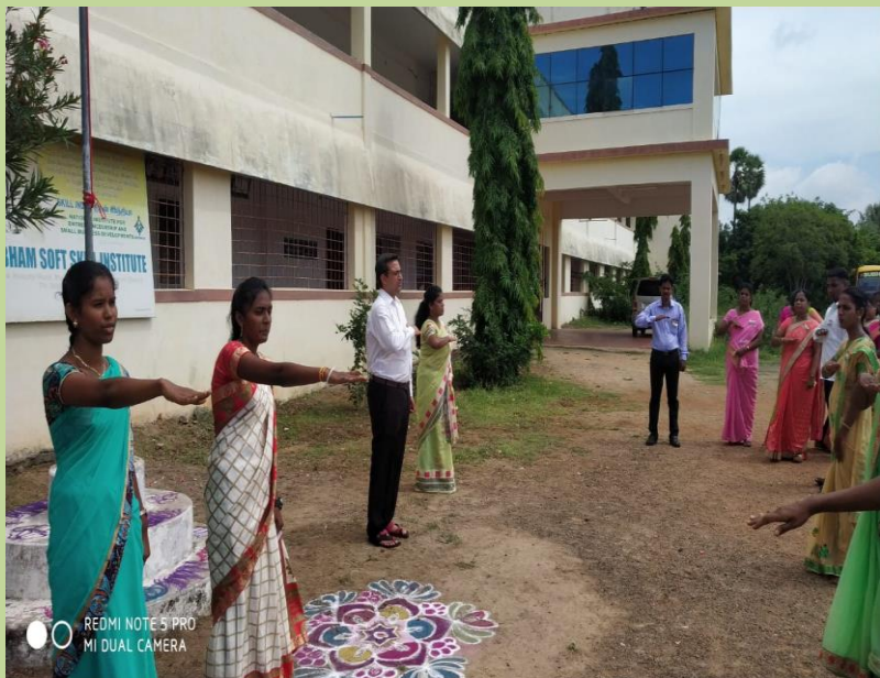
Independence day was celebrated , Flag hoisting was done by Secretary sir and Programs were conducted by student teachers