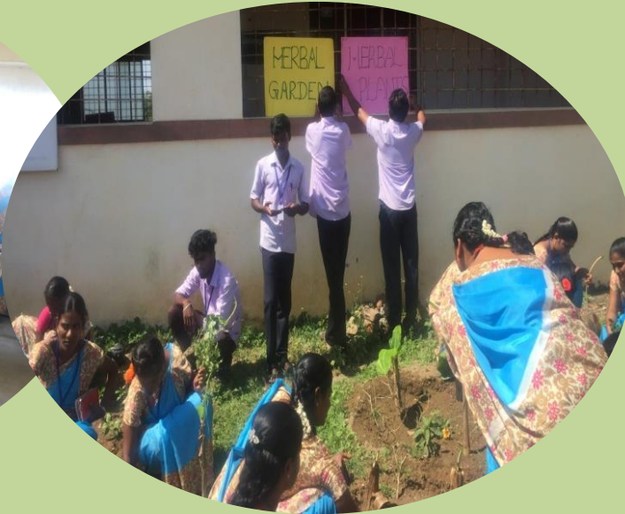
SUB HAM HER BAL EVS